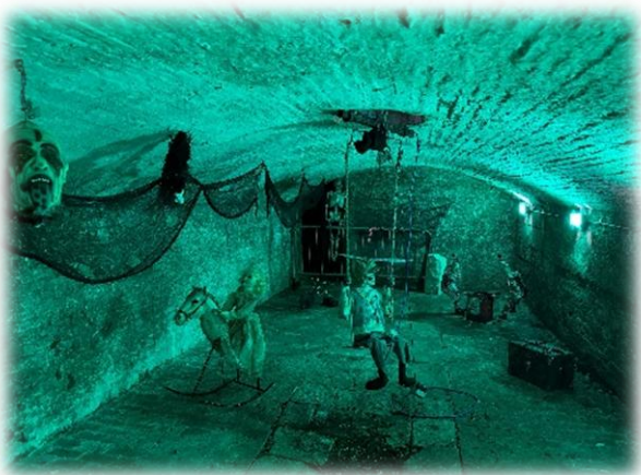
Halloween in the Undercroft