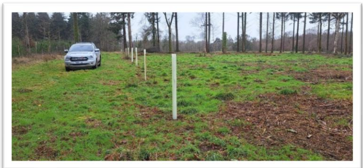
Elms in tubes on edge of new conifer planting

success with some of the varieties available in recent years. The elms were donated to us by the South Downs National Park for which we are very grateful, they are excellent specimens and should do very well.