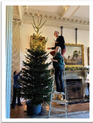
Dressing the House for Christmas