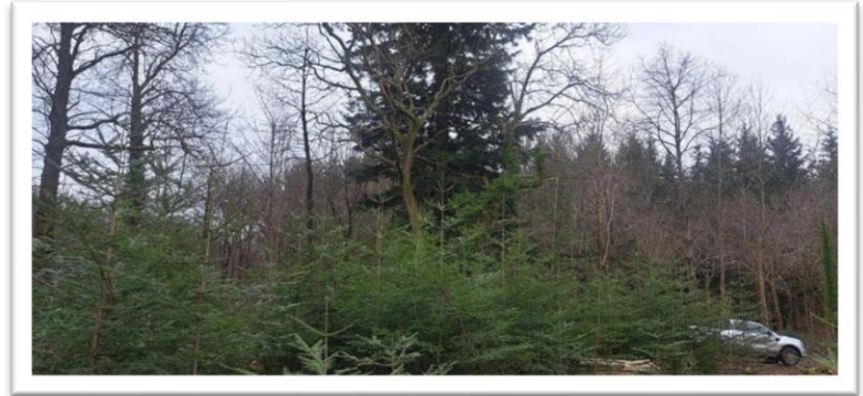
Young Grand Fir released from coppice, seed tree in the background

naturally in North American climax forest. This is an interesting experiment and will add some species diversity to that immediate area.