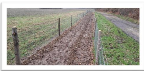
Double row of hedge plants

remainder is in place next winter it will join several of our hedges to those of our neighbours, creating a wildlife corridor and nesting/foraging habitat. As it is fenced, it will also help to stop uncontrolled dogs running out across the fields and disturbing any ground nesting birds and as we develop this area further for environmental outcomes this will be very important. The new hedge consists of 70% hawthorn, 10% each of field maple and hazel and 5% each of guelder rose and spindle.